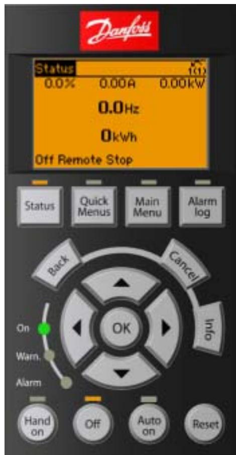
Control panel LCP 102