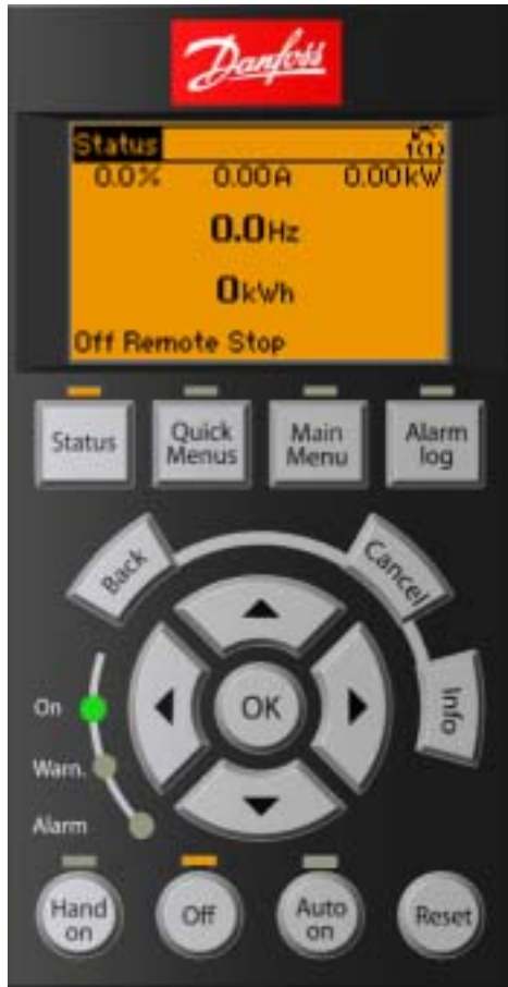
Control panel LCP 102