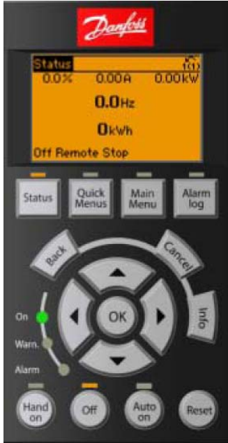
Control panel LCP102